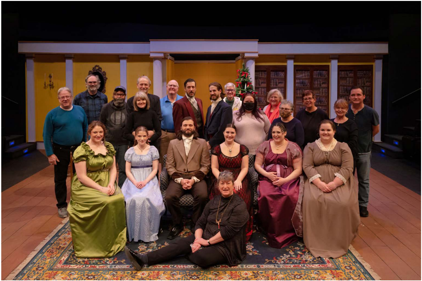
Miss Bennet: Christmas at Pemberley - Team