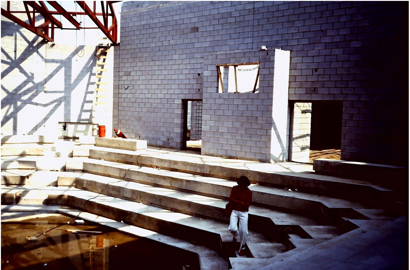
Archive – SVT being built in 1981-82

We hope that as 2022-2023 season unfolds celebrating our 40 th anniversary in the Scarborough Village Recreation Centre, that our series of Free Workshops will inspire the community to come out and play with us.