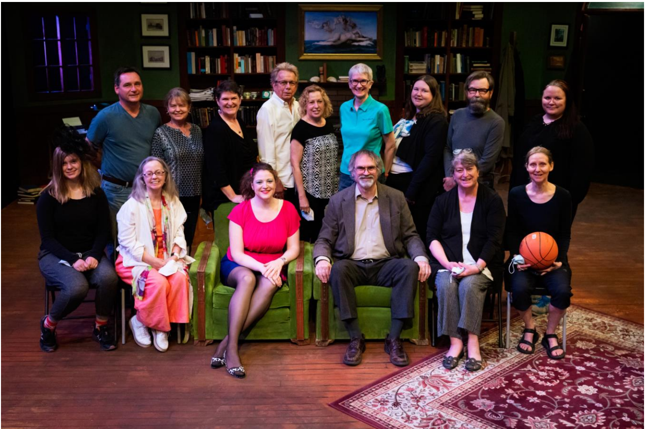
Educating Rita – Team