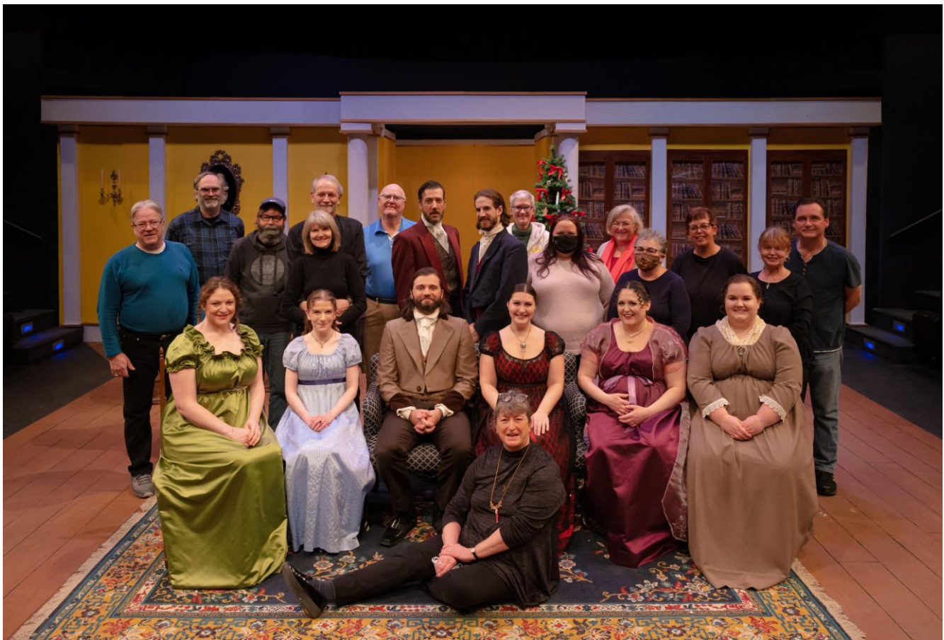
Miss Bennet: Christmas at Pemberley - Team