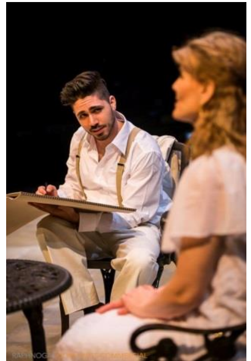
Enchanted April – 2015