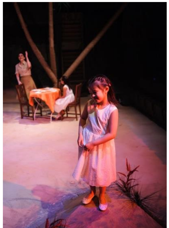
South Pacific – 2013