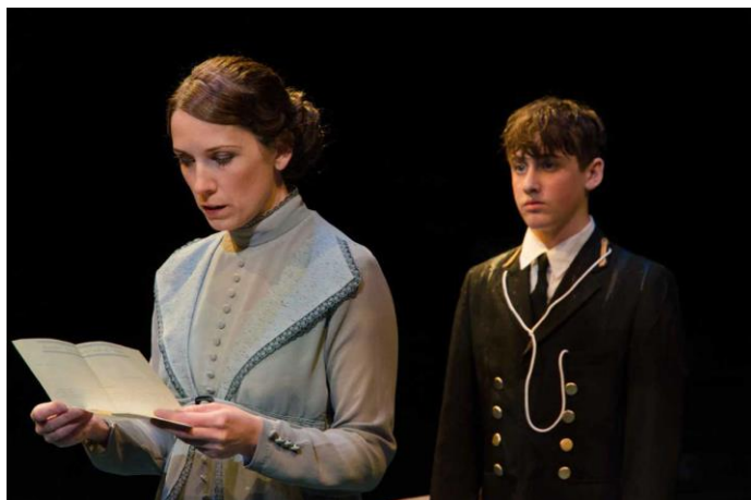
The Winslow Boy – 2014