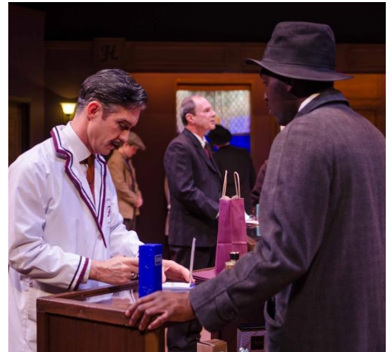
Parfumerie – 2015