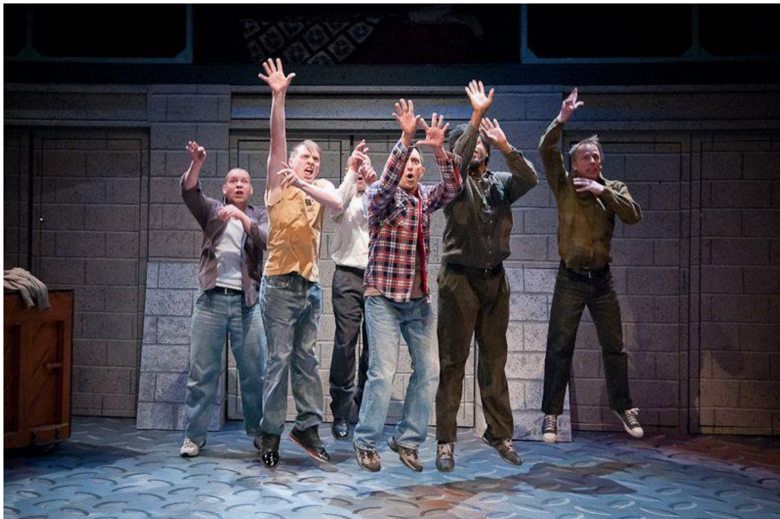
The Full Monty – 2011

Contact us through the box office at 416-267-9292. Indicate that you are calling about corporate sponsorship opportunities.