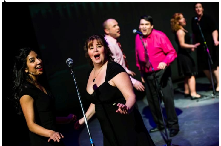
World Goes Round – 2015