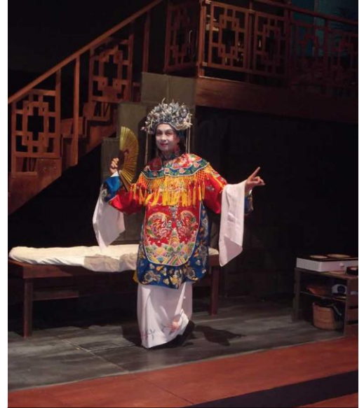
M. Butterfly - 2013

Recognition is given in context of the specific project.