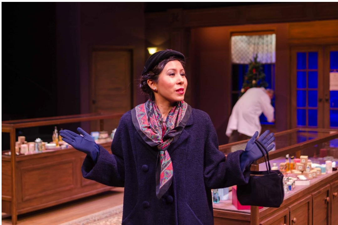
Parfumerie – 2015